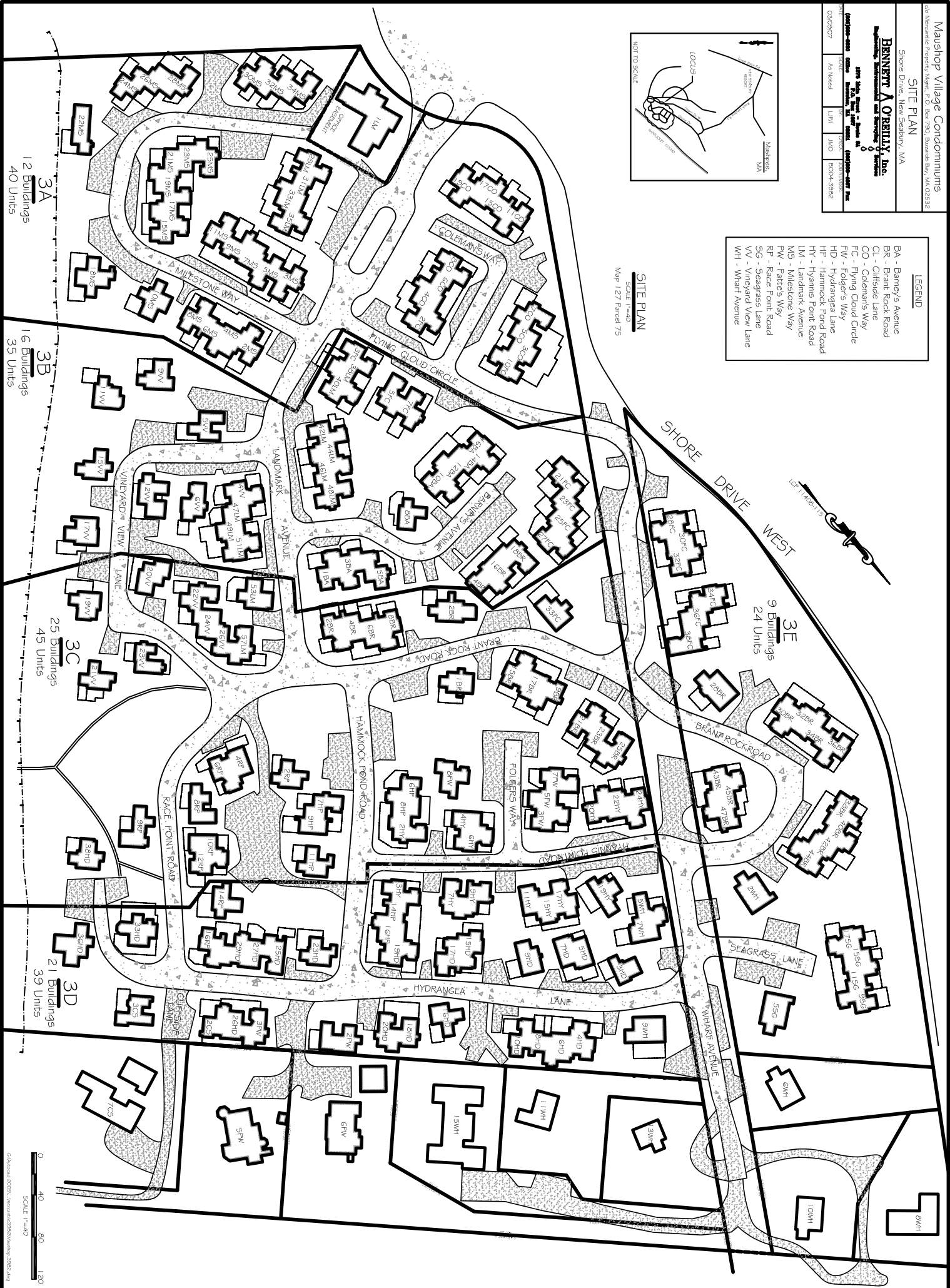
SITE PLAN SCALE: 1"=40' Map 127 Parcel 75

3A 12 Buildings 40 Units 3B 16 Buildings 35 Units 3C 25 Buildings 45 Units 3D 21 Buildings 39 Units 3E 9 Buildings 24 Units